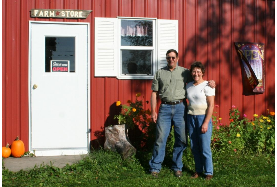
Selling raw milk, eggs and meat in an on-farm store has helped to diversify the Scheffler's income and create meaningful relationships with their neighbors.

The Schefflers like to do as much of the labor by themselves as possible, so they have made it a point to invest in equipment that will help them work efficiently and achieve high-quality products. For example, the stationary mixer installed in 2008 replaced a Rissler cart (a mobile mixer) and Ed is now producing a much more consistent ration for his cows. When it comes to