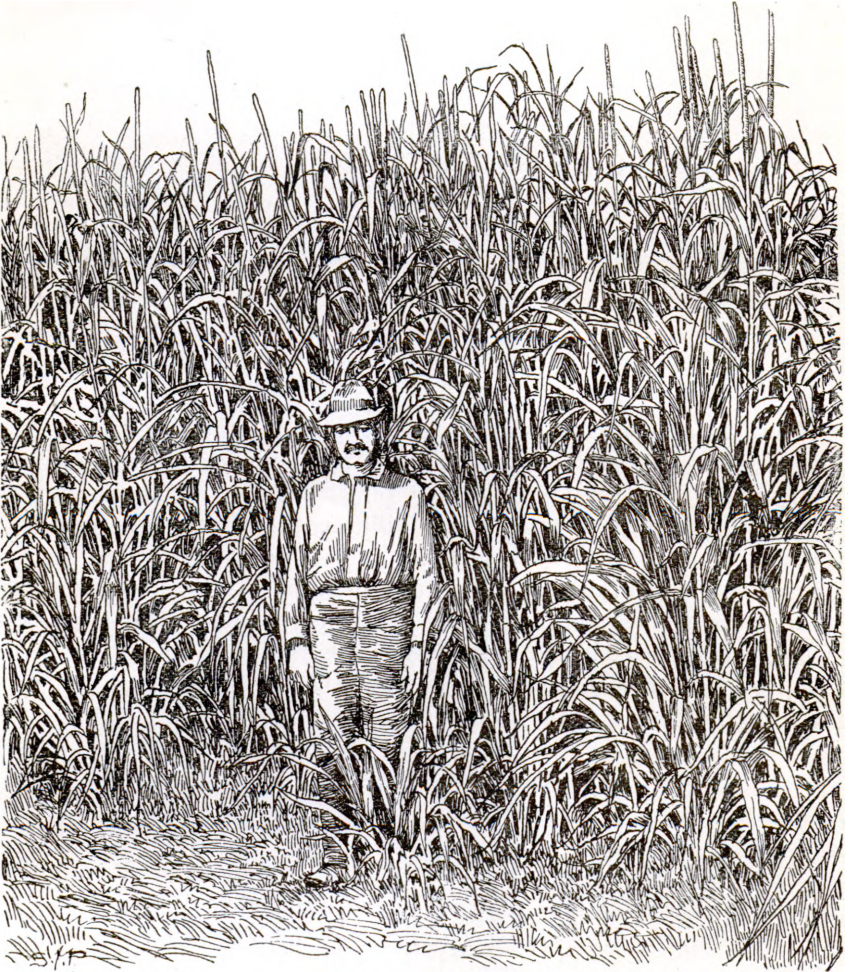
FIG. 3.—Growth of pearl millet on rich land.

On poorer, clayey, or sandy soils the yield of forage will be proportionately decreased, but may still be comparatively valuable, since on poor soils the yield of any forage crop is necessarily diminished. Pearl millet thrives best in a warm soil, and a sandy loam is therefore better adapted to its needs than a heavier soil of equal fertility.