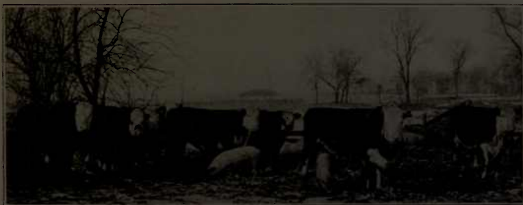
FIG. 3.—LOT 1, FED SOFT CORN FROM THE SHOCK, AT END OF TRIAL

The calculated consumption of 40.68 pounds of ear corn per head daily by the pasture lot is based on the assumption that there was as