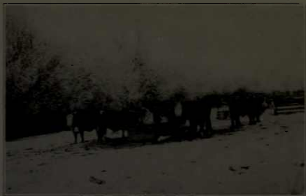
FIG. 2.—FEED EQUIPMENT FURNISHED ALL LOTS

The broken ear corn used by Lot 3 was from another field of soft corn and appeared to be a little less mature than that used by the other soft-corn lots, altho moisture determinations did not indicate