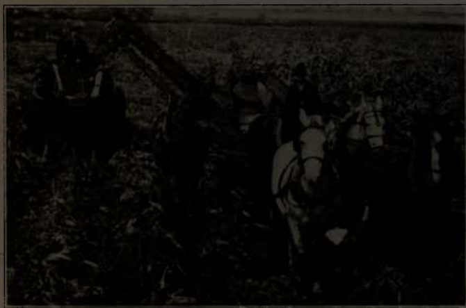
FIG. 6.—SNAPPING FROSTED CORN FOR EAR-CORN SILAGE

Six experiments involving the use of ear-corn silage for cattle feeding have been conducted at the University of Illinois beginning in 1916. The most extensive trial was made with the frosted crop of 1924, when soft corn was fed experimentally in the form of shocked corn, as standing corn pastured in the field, as broken ears brought from the field as needed, and as ear-corn silage made from the snapped