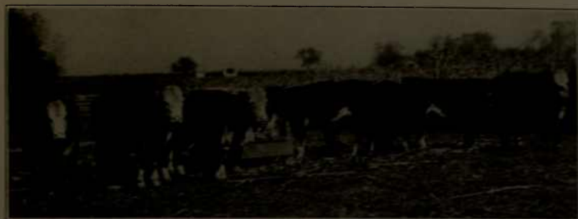
FIG. 1.—THE STEERS AT THE BEGINNING OF THE TEST

This group is representative of the quality and condition of the steers in all the lots when started on experiment. They were selected from a drove of western-bred Herefords and weighed approximately 1,000 pounds.