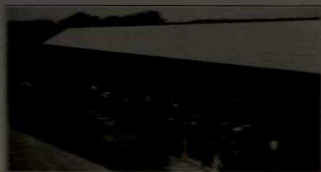
FIG. 5.—Harrow Used in 1925-26 Calf Feeding Trial.

The remaining three steers from each lot that were continued on experiment until the ear-corn silage was exhausted on September 20 were slaughtered at the Experiment Station. Feed and water were withheld for 24 hours, and final weights were taken just before slaughter. On the basis of these weights and cold carcass weights, the dressing percentages were 62.09 percent for the shelled-corn lot and 60.43 percent for the ear-corn silage lot. While all of these carcasses graded choice, the shelled-corn lot showed the higher finish and a firmer lean as judged by the lean in the eye of beef.