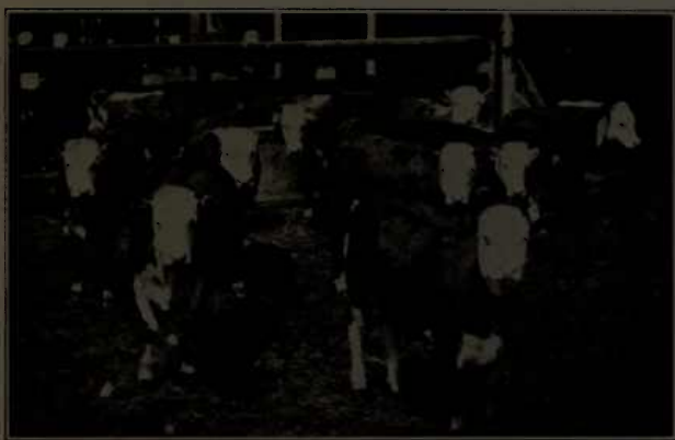
FIG. 4.—FEEDER CALVES USED IN 1926-27 EXPERIMENT

At the end of 140 days' feeding, Lot 7 was divided. Ten of the calves, designated as Lot 7a, were continued on the original ration. Five calves, designated as Lot 7b, were given shelled corn in addition